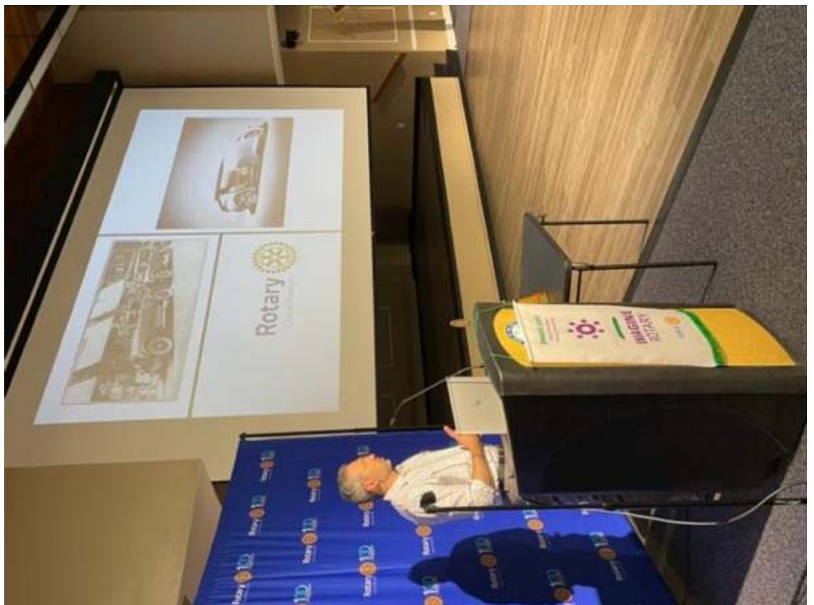
Rotary Club of Plymouth Broadcaster 7/22/2022