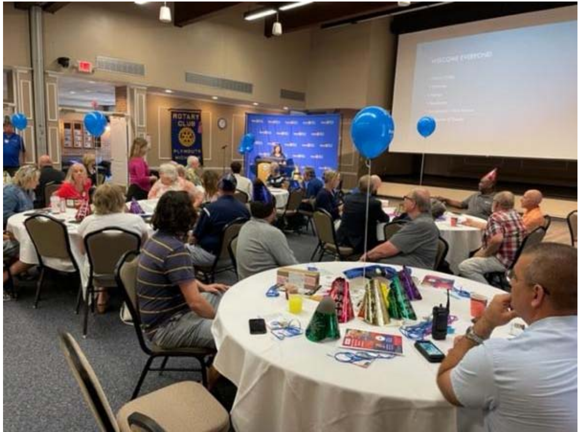
Rotary Club of Plymouth Broadcaster Friday, July 15, 2022